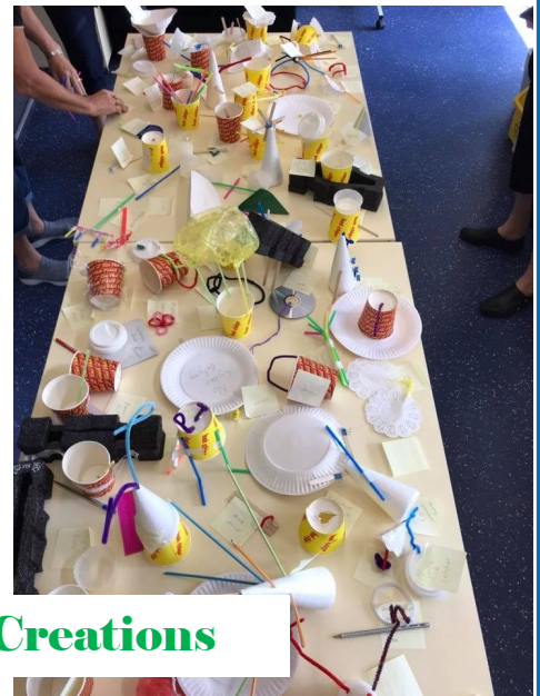
Staff Development Day Creations

A proud member of the Taree Learning Community